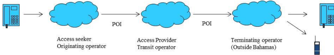
Diagram A.10: International Call Transit Service

A.3.2. Call handover: A transit call shall be handed over at the Point of Interconnection in accordance with Clauses D.2.3 and D.2.4.